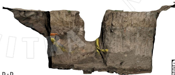
D - D