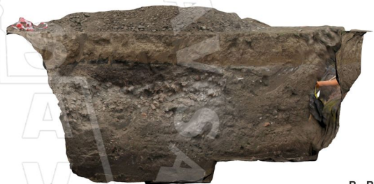
B - B