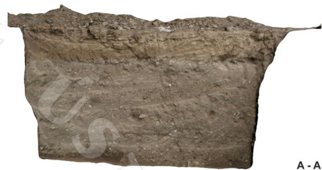
A - A